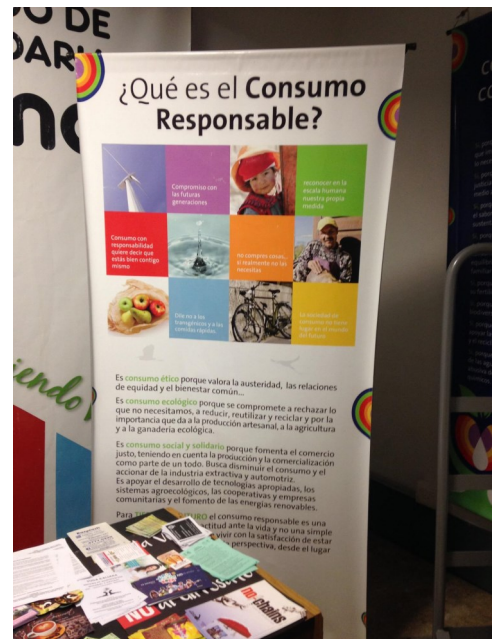
Submitted by Grant Schwab, SIT in Argentina