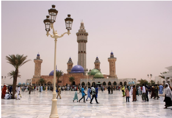
UVA student photo, Senegal