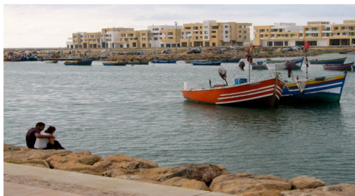
UVA student photo, Rabat, Morocco